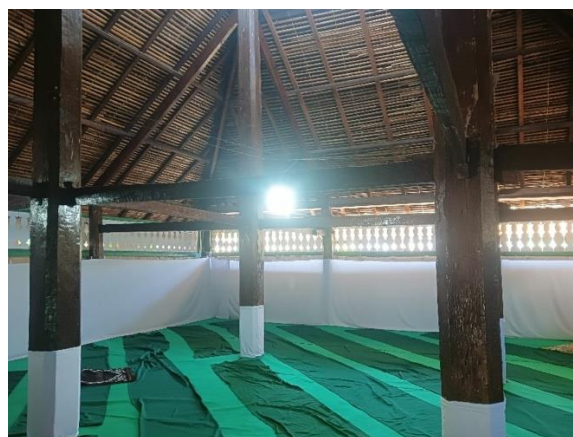
Figure 4: The shape of the Soko Guru Pole of the Penampaan Origin Mosque

Based on the picture above, we can see that the roof is made of nipa leaves. At that time almost the entire area around the mosque was full of nipah leaves: