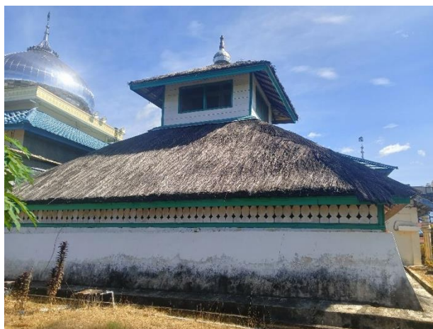
Figure 3: Roof Shape of Penampaan Mosque

The Penampaan Asal Mosque features a pyramid-shaped roof, with four triangles forming one layer of the pyramid roof, and another four triangles forming the second layer. This roof design is an evolution of the saddle roof, with each triangle having a 30-degree slope to efficiently direct rainwater flow. The image below illustrates the shape and arrangement of the Penampaan Asal Mosque's roof.