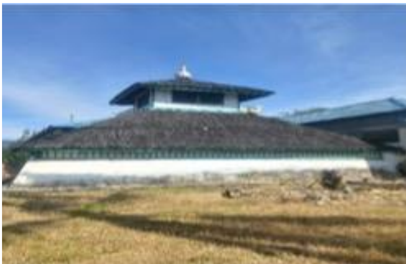
Figure 2: The Current Penampaan Asal Mosque (2023)