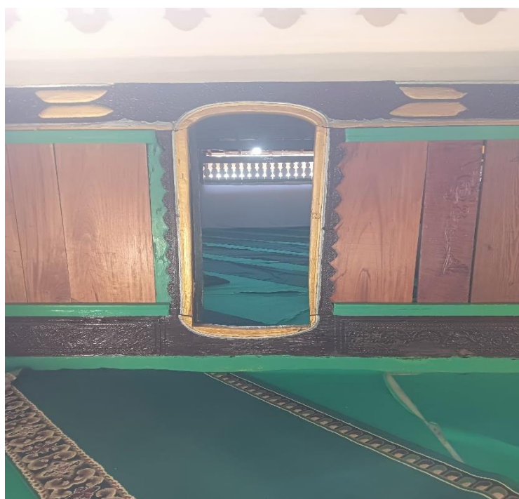
Figure 5: Entrance of Masjid Asal Penampaan

The maintenance and renewal of the doors of the Penampaan Asal Mosque with a simple approach while preserving their original characteristics depict the community's attitude towards the preservation of traditional values. Although functionally the doors may be considered simple architectural elements, in a cultural context, the doors of the Penampaan Asal Mosque remain valuable and appreciated over time.