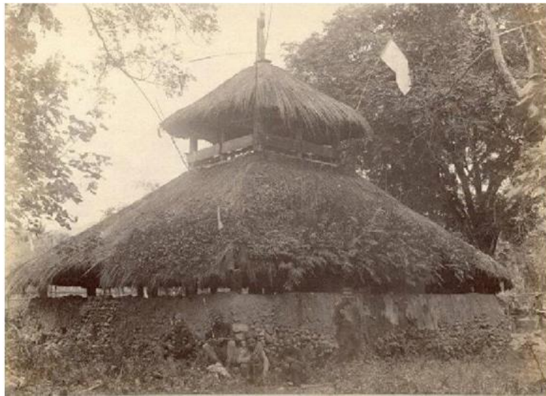
Figure 1: The Original Penampaan Asal Mosque

The materials used in the construction of the Penampaan Asal Mosque are traditional materials commonly found in ancient mosques in Indonesia. The mosque walls are built from a mixture of soil and husks, while the roof uses nipah leaves (Sofiana & Naufal, 2023). In the inland mountains of Gayo Lues, there is lush growth of serule and nipah trees. The leaves from both types of trees are used as roofing materials in the construction of traditional buildings in the area. Below is an image of the Penampaan Asal Mosque, which is still very well preserved in its original state, before the addition of the new mosque building.