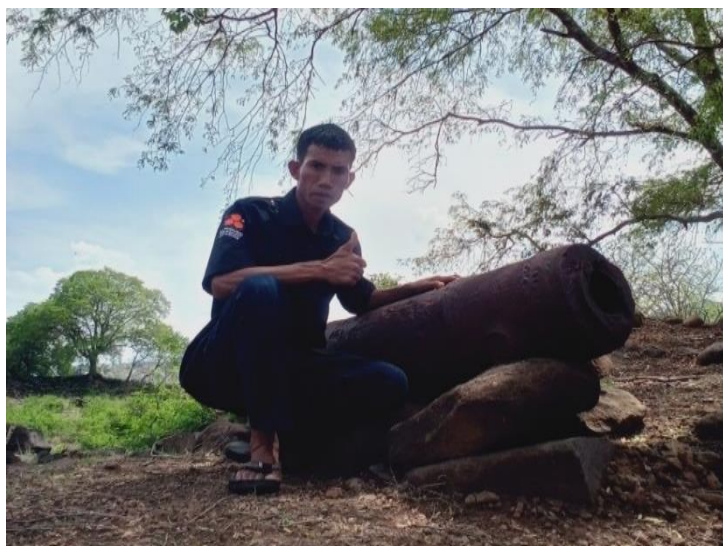
Picture 3. One of the cannons left by Fort Asakota

December 8 1669 as a result of the Bima Kingdom intervening in the war between the Gowa Kingdom and the Netherlands. In this war, the Gowa kingdom suffered defeat and was forced to sign an agreement with the Dutch in 1667, known as the Bongaya agreement (Malla Avila 2022). The agreement was to sever the cooperative relationship between the Bima kingdom and the Gowa kingdom so that they would not help each other in war. Furthermore, in 1669 the Dutch colonial government began carrying out trading activities in the territory of the Bima king and prohibited the Bima king from collecting port taxes for company ships. Officially the Dutch colonial government exerted its influence when Mr. Haagman was sent to become Resident in Bima in 1938. With the entry of power and influence of the Dutch colonial government, politically he changed the government system of the Bima kingdom by limiting the sultan's rights (Alrianingrum 2016).