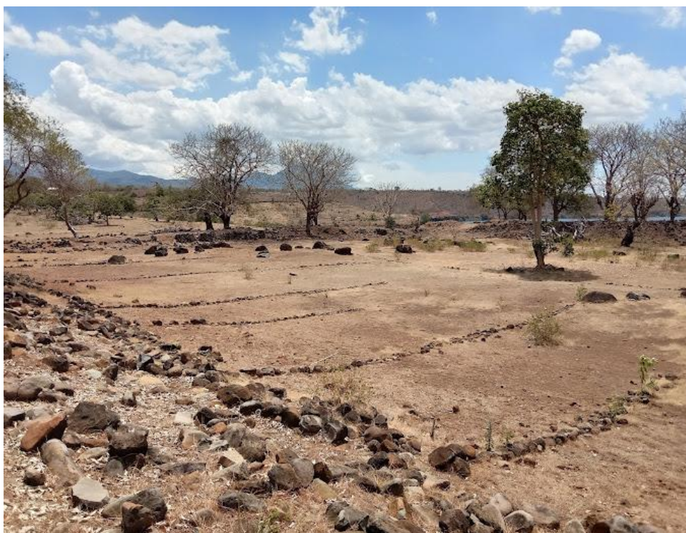
Picture 2. View of the inside of Asakota Fort

In the political situation in the Bima sultanate, the Dutch colonial government began to intervene in the affairs of the Bima sultanate, starting in 1908. The Dutch colonial government intervened by making a political agreement (Lange Politie Contract) between Sultan Ibrahim and the Netherlands (Wibowo 2019). The contents of the agreement stated that Bima became part of the Dutch East Indies nation and was forced to recognize the existence of Dutch colonial power and government in Bima. Through this agreement, the Dutch colonial government invested its power by forcibly collecting taxes and withdrawing harvests from the people of Bima. This social condition boomeranged and then community resistance arose due to the treatment of the Dutch colonial government which colonized the people and the Bima sultanate from various aspects of life (Alrianingrum 2016).