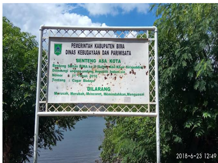
Picture 1. Asakota Fort Entrance Signboard

Asakota Fort still has historical remains, namely an ancient cannon stored in the left corner of the fort facing north of Bima Bay. If you look at the traces, Asakota Fort has two cannons stored in the right corner and the left corner, but what is still there today is the cannon on the left side (Tondo 2005).