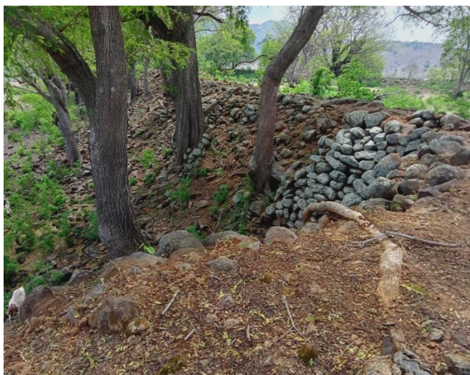
Picture 5. The western rock formations are visible

After the VOC (Vereenigde Oostindische Compagnie) succeeded in conquering the Gowa-Tallo kingdom, the Dutch Colonial government wanted to expand its colony to the Bima Kingdom by shipping and trading at the port harbor of Bima. After the political agreement made by the kingdoms on the island of Sumbawa with the VOC in Makassar in (1761-1775) the colonial government began to exert its influence on the island of Sumbawa. In this agreement, the Bima Kingdom began to be pressured by giving a consensus to the VOC to trade in its sovereign territory. By making a political contract, the Dutch colonial government carried out political penetration to exploit the economy in the Bima Kingdom region (Indra and Aziz. 2005).