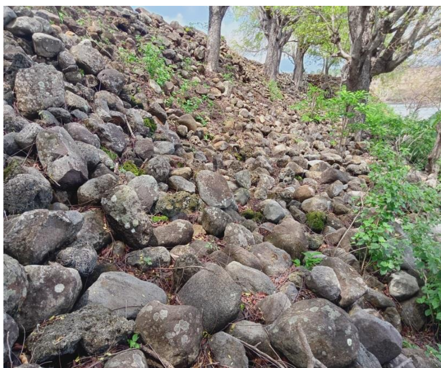
Picture 4. The eastern rock formations are visible Source: Personal Documentation

Asakota Fort is a defensive fort of the Bima kingdom which is located in the northern part of the Bima Strait and is flanked by two lands. This fort was one of the sea defense forts to repel and monitor the entry of colonial troops entering the Bima Kingdom. After the Dutch succeeded in occupying the Gowa Tallo kingdom, led by the Hasanuddin Sultanate, this kingdom became increasingly weakened and cornered due to the war that occurred from 1654-1667, led by the VOC (Raditya et al. 2022). This war gave birth to the Bongaya agreement which had to be signed by Sultan Hasanuddin and his people which contained, (1), the VOC obtained trade monopoly rights in Makassar (2), the Dutch could build a fort in Makassar called Rotterdam (3), Makassar City released Bone and on the island outside Makassar (4), Aru Palaka is recognized as the king of Bone (Mansyur 2006).