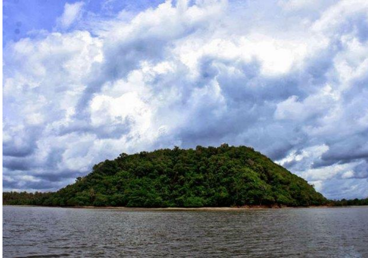
Picture 2. Saranjana Cape located in Pulau Laut