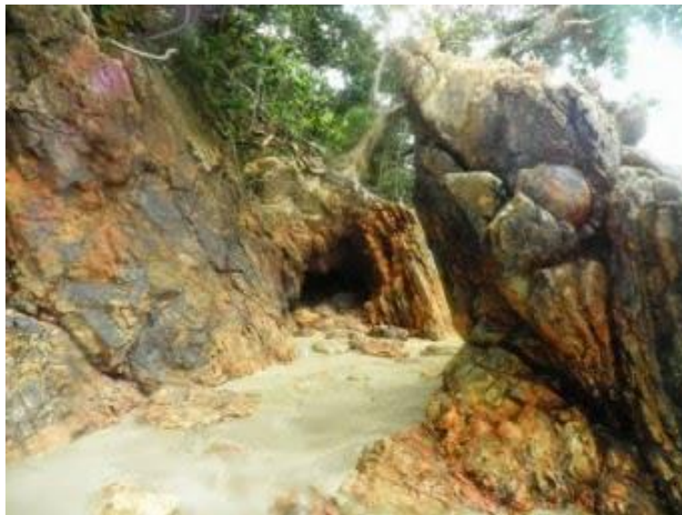
Gambar 3. The location of the cave is believed to be the public entrance to the Saranjana

The search finally stopped in local oral sources. Normasunah (2017), in a publication titled Myths in Legend of Halimun Island Kingdom in Kotabaru Regency , giving another view. Local literary hanging from the " kulturalgebundenheid " or cultural community. The Legend of Halimun Island Kingdom . The central figures are the King of Pakurindang, Sambu Batung and Sambu Ranjana. She holds appropriate myths. Mount Saranjana is a reincarnation of the Halimun Island Kingdom . In the myth, King Pakurindang says, "Sambu Batung, you and the Putri Perak stay in the North of the island. Go on opening up and participating in real nature, and you Ranjana Sambu live in South to continue your ascetic. I bless that you guys did this path in life. But remember, even though living in different worlds, you guys should still get along well. Always help each other and alert". In conclusion, the name of which later Ranjana Sambu undergo "evolution" pronunciation became "Saranjana" in the local tongue.