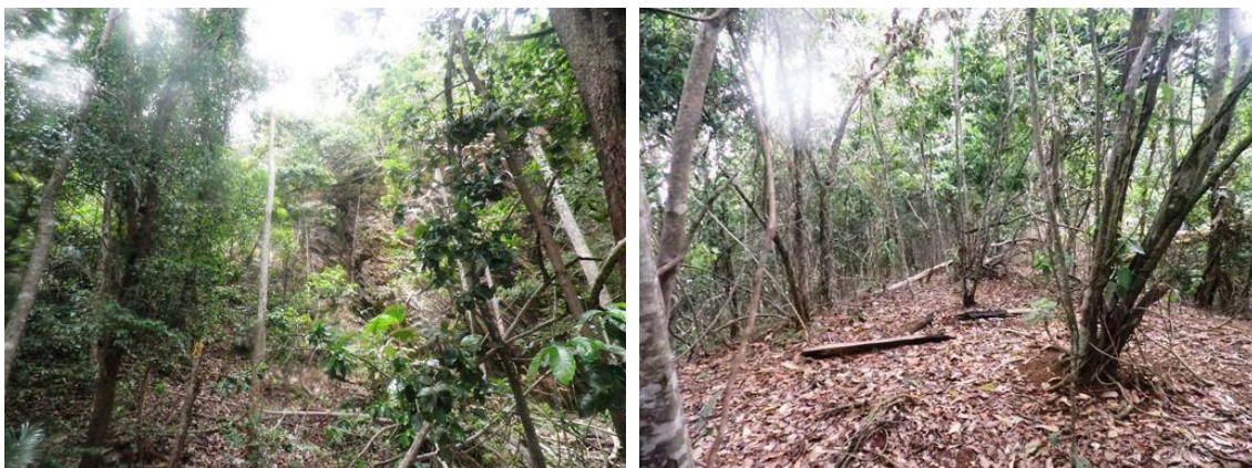
Picture 5. Location Road towards Peak and Peak of Saranjana