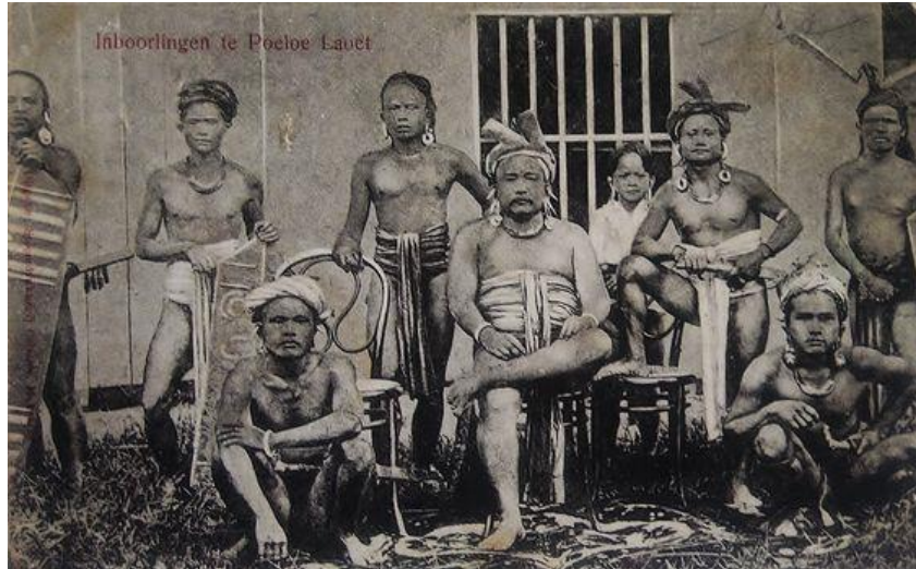
Picture 4. Photo of the Dayak Chief of the Pulau Laut, 1900s.